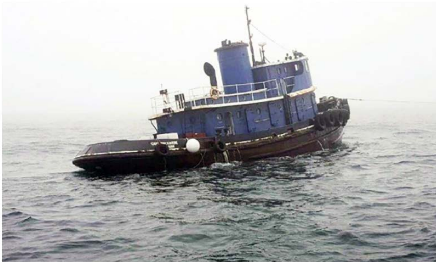
The 80-foot tugboat Capt Mackintire is shown in tow off the coast of Portland. It later sank about 3 miles south of Kennebunk in about 158 feet of water. The Coast Guard is working with federal, state, and local authorities to evaluate pollution potential and respond to reports of sheening in the area.