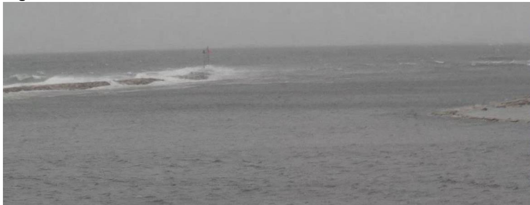
Over the Jetties